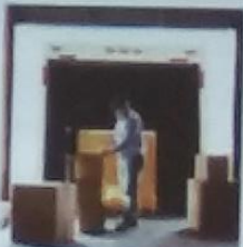
SPEED TO MARKET